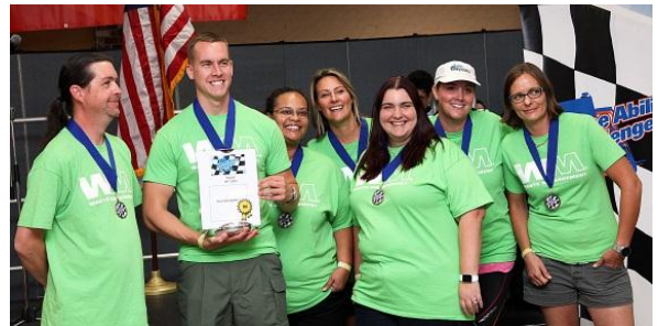
Waste Management took home the Gold!